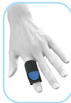
10303 (Small) 10304 (Medium) 10305 (Large) Finger Sleeve