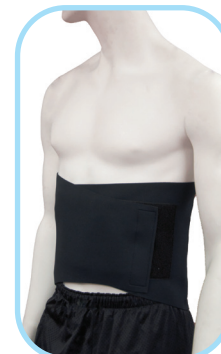
30108 Back Wrap