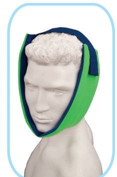
30109 TMJ Wrap