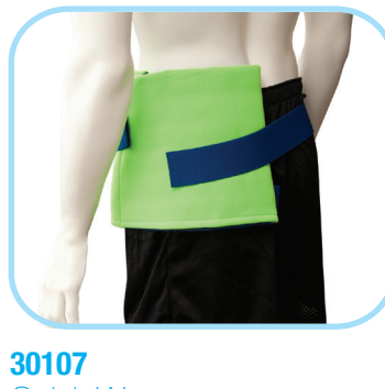
30107 Quick Wrap