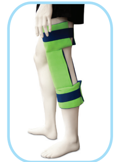
30102 CPM Knee Wrap