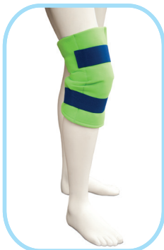
30103 (Standard) 30104 (Large) Arthroscopy Knee Wrap