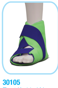
30105 Foot/Ankle Wrap