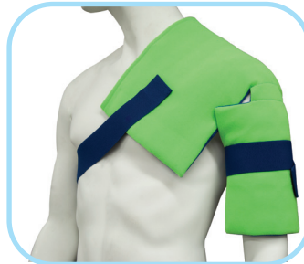
30100 Shoulder/Hip Wrap