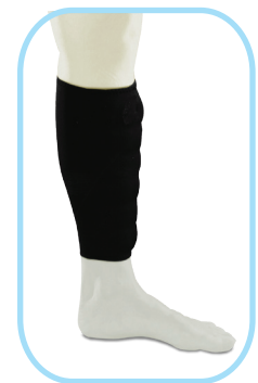
30011 (Small) 30013 (Large) 30012 (Med) 30014 (X-Large) Shin Wrap 30036 (Universal)